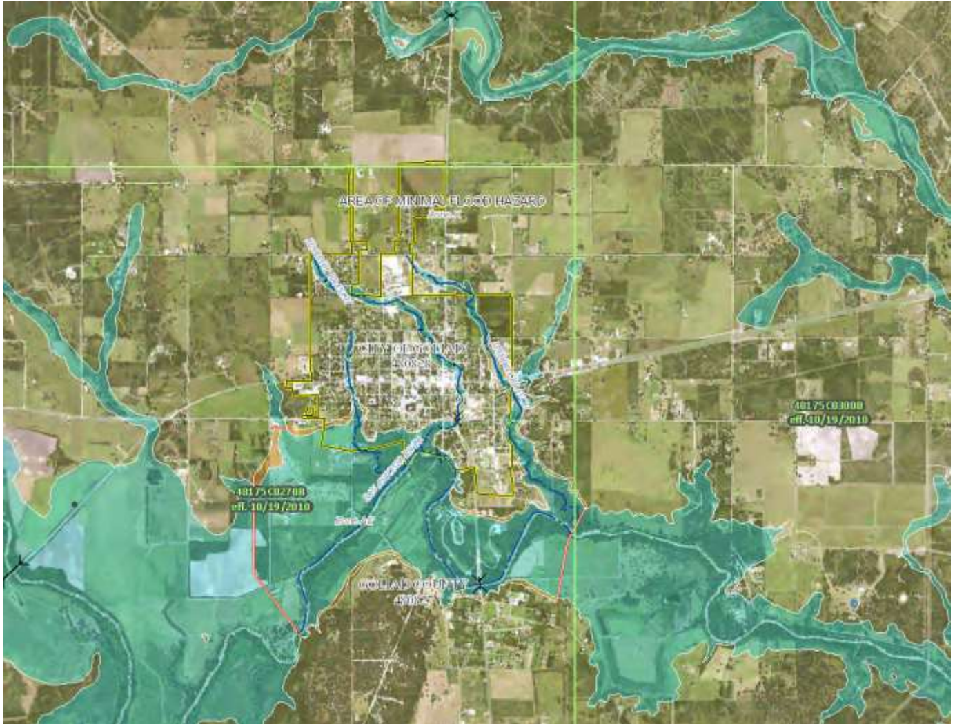
Exhibit A – Goliad City Flood Map